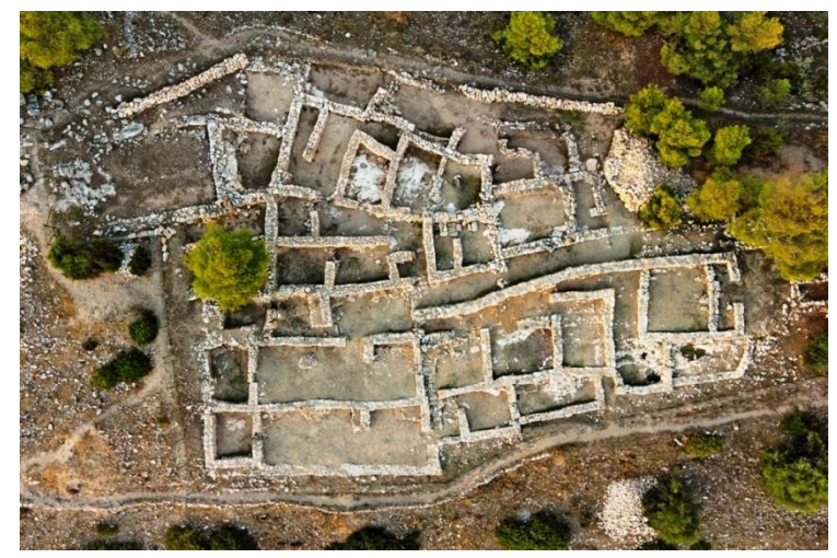
Kanakia. Central Building Gamma, with the twin megaron.