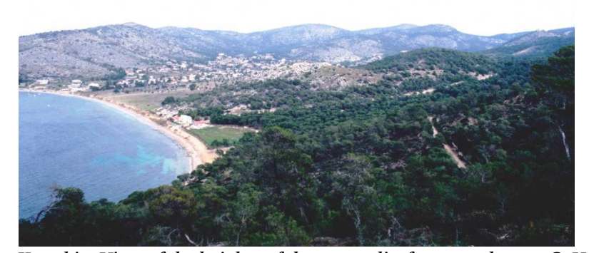
\textit{Kanakia. View of the heights of the acropolis, from southwest.}

On the upper terraces of the coastal acropolis, a series of large compounds of palatial character, apparently planned and controlled by the local Late Mycenaean elite, have been revealed by the excavations of the University of Ioannina. In these are included: the Central Building (Gamma), occupying, on present estimates, an area of 750 m² and incorporating a maze of rooms and corridors, a twin megaron and a small shrine, and the Eastern Complex, with a main access through an unusual fortified gate, probably serving a variety of functions in the public sector. Between the two complexes extends Building Delta comprising