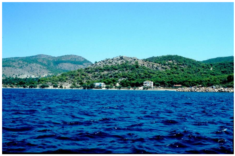
Kanakia. View of the coastal acropolis, from west.

Of all prehistoric settlements known on Salamis, the acropolis-site at Kanakia on the southwestern coast shows the longest record of habitation, documented already from the Final Neolithic period (4th millennium B.C.). Like other Mycenaean palatial sites of the Greek Mainland, this island centre appears to have reached its floruit in the 13th century B.C. and to have been abandoned at the beginning of the Late Helladic III C Early period, i.e. shortly after 1200 B.C.