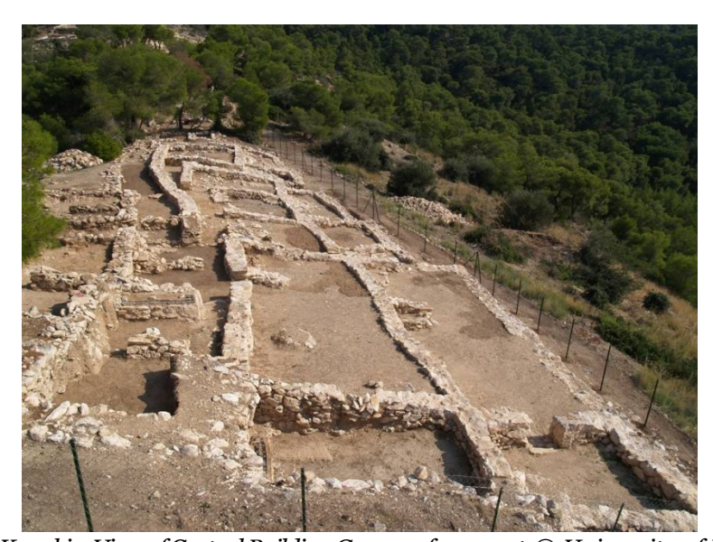
\textit{Kanakia. View of Central Building Gamma, from west.} \\ \textcircled{o} \textit{ University of Ioannina Excavation Archives.}