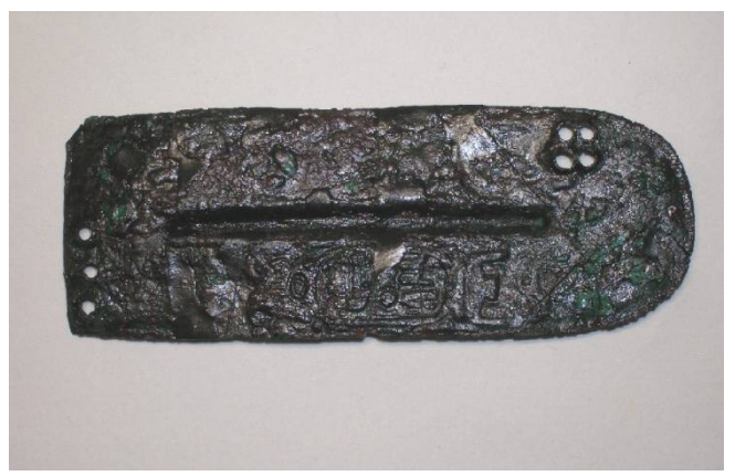
Kanakia, Building ID. Bronze plate from scale armour, stamped with the cartouche of Ramesses II.

A unique find, with wider dimensions, is a bronze plate from a scale-corselet of Near-eastern type, stamped with the cartouche of Ramsses II (1279-1213 B.C.).