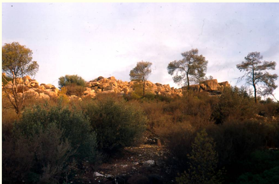
Ginani, Citadel A. View of the citadel, from the east.