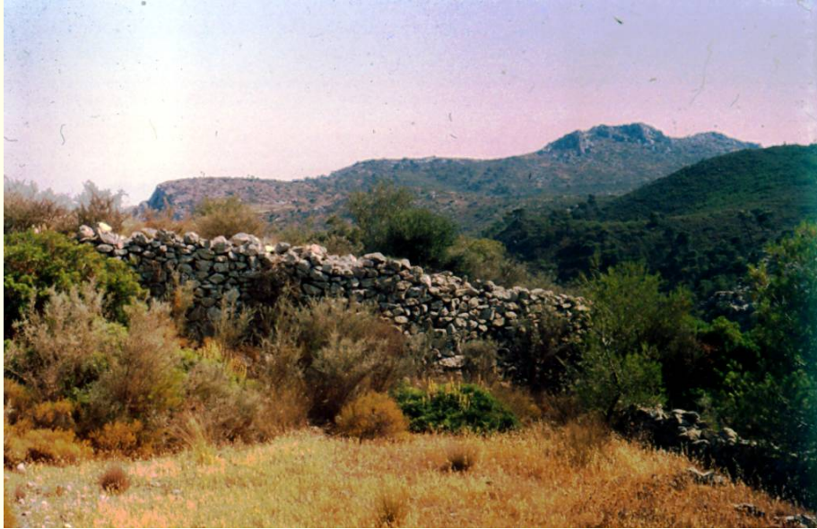
Ginani, Citadel A. The north part of the defensive peribolos, from the north.