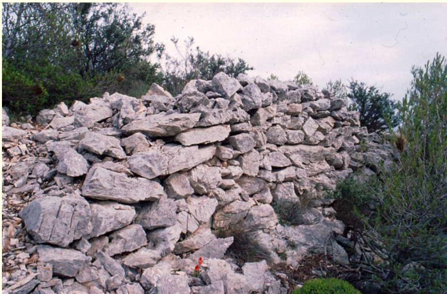
Ginani, Citadel B. The west part of the defensive peribolos, from the northwest.