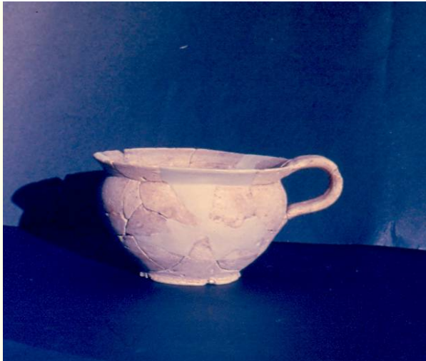
Ginani, Citadel A. One-handled cup, of Late Geometric date, from a room inside the citadel, now on display in the Archaeological Museum of Salamis.