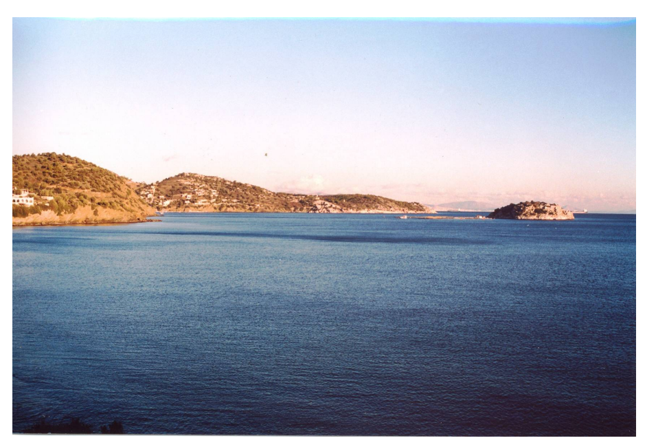
View of the Bay and islet of Perani, from west/northwest.

On the Islet of Peranisi, which has been recognized as a refuge site of the Early Byzantine period (6<sup>th</sup>-7<sup>th</sup> century A.D.) in the Bay of Perani and certainly of importance within the framework of the Archaeology of alien invasions in Greece, a survey by the University of Ioannina has produced significant results. The most important outcome of the survey work has undoubtedly been the construction of the first archaeological map of the islet. Visible architectural remains include the foundations of a Late Classical-Early Hellenistic rectangular tower on the top and the foundation-course of an Early Byzantine defensive enclosing wall, furnished with two (2) rectangular towers on the north/northeast side of the islet. Moreover, a wet-dock cut into the rock has been located at a protected place of the northeastern coast of the islet; it appears to have been used by the refugees and probably later by a garrison of Byzantine Emperor Constans II.