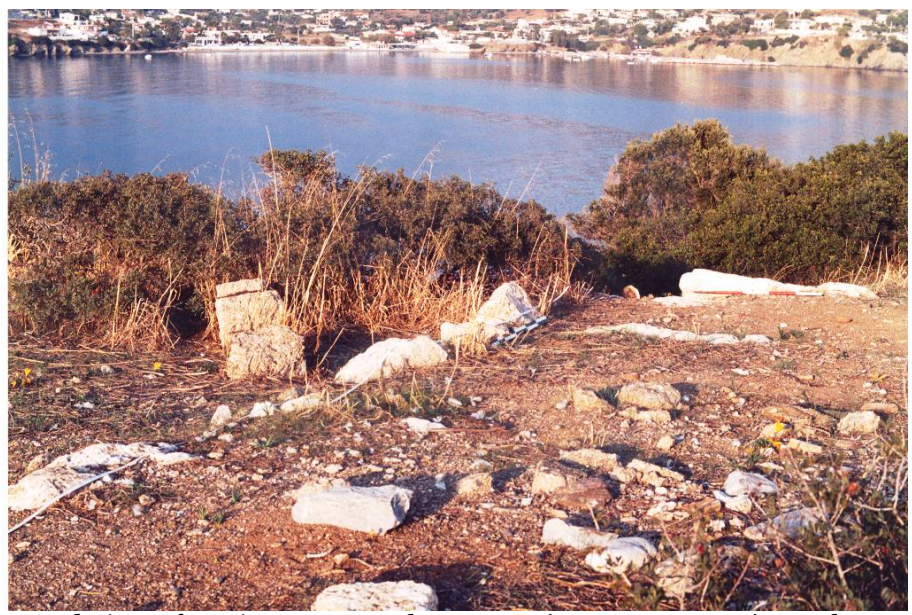
Foundation of ancient rectangular tower ( 4^{th} century B.C.) on the top of the islet.